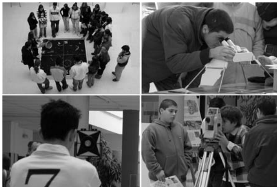
Figure 1. Working on the site.

These sheets had the function of serving as a guide during the activity, clarifying questions and stimulating participation by presenting fourteen simple activities-games to be done during the visit, looking for the solutions within the actual interpretive set-up, whilst others were to be solved with the help of a teacher in the classroom. They also contained a selection of bibliography and links for those participants interested in knowing more about the contents of the activity.