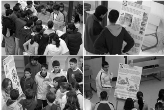
Figure 2. Visiting the exhibition.

remains of a Palaeolithic field site and archaeological work tools. Plan 0 was established to measure the depth of the objects, making available a complete topographic station and a telescope rod. Once the participants were familiar with the methodology of the fieldwork, they were able to take measurements using the equipment and integrate a set of concepts from diverse scientific disciplines.