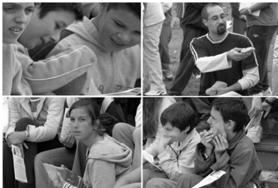
Figure 3. Carving workshop.

Before the leave taking, they were asked to fill in a small questionnaire, individually and anonymously, which was used as a tool for